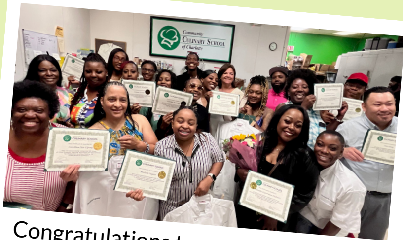
Congratulations to Class 73 on their Graduation in 2023!