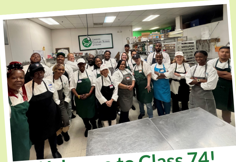
Welcome to Class 74! May 9, 2023

Shoutout to Technocom for many years of efficient, attentive, and supportive service to CCSC!